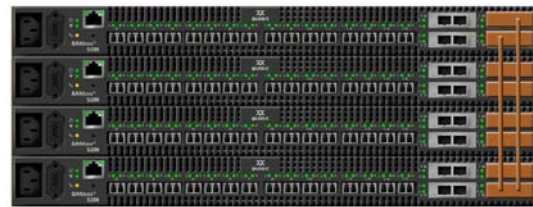
Four switches for 64 ports